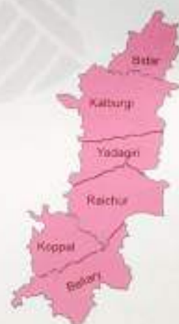
Kalyana Karnataka Region